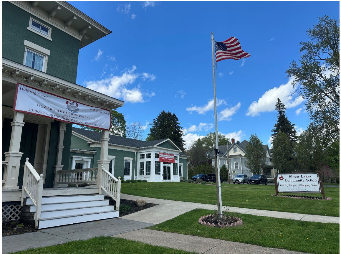
Main Office 51 Broad St, Lyons NY 14489

If April showers bring May flowers, let's hope it gets warm soon, so we see some pretty blooms. May is a very busy month around here at Finger Lakes Community Action, with us being in business for 60 years! You heard that right, we have been offering services in our community for 6 decades. We're very proud of our footprint and are looking forward to celebrating at our open house on May 21 st from 4 - 8. We would love to see you at 4 for a short presentation. We will be here until 8 and there is also a Wine Walk through Lyons if you wish to attend. So please come celebrate 60 years with us!