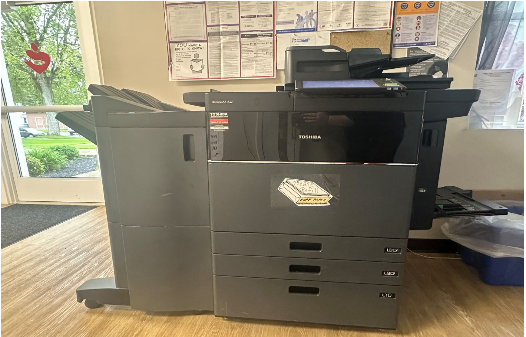
Main Office Copier: 51 Broad St, Lyons NY 14489